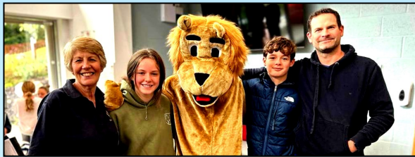
mascot, here with the Windsor Foodshare team.