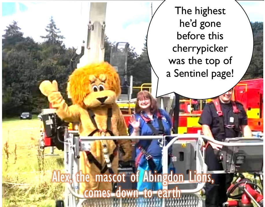
Alex, the mascot of Abingdon Lions, comes down to earth